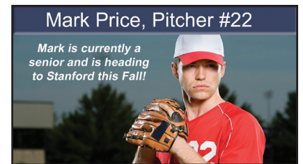
Slide shows can be prepared prior to the game, loaded on an SD card and streamed live before or after the game, at halftime or during commercial breaks

Add up to 50 full screen custom graphics (PNG or JPG format) from an SD card to the GY-HM250SP and store them in the camera for live streaming or recording in the HD mode. Overlays and slides are a perfect way to advertise your sponsors either as banners during the game, or full screen at halftime. It's also a great way to introduce the team members via a pre-game slideshow. Place a watermark anywhere on the screen — even while doing lower-third score overlays.